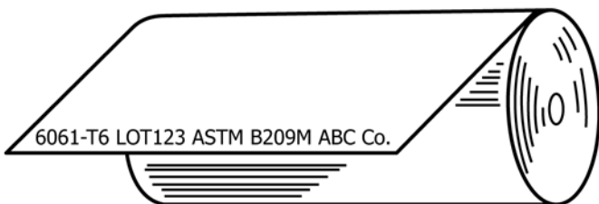
FIG. 2 [M] Spot Marking for Coiled Sheet